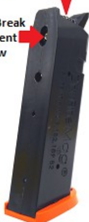
Pictured is the DryFireMag for double-stack Glocks

Adjusting the amount of pre-travel (the point of the simulated release of the firing pin).